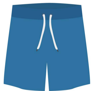
PIRIPOU POTO shorts