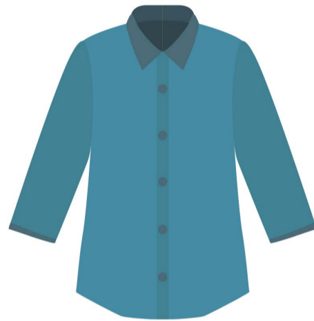
'A'U TĀNE shirt