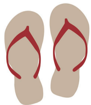
TĪĀMA'A sandals / slippers