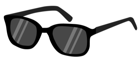
TĪTĪ'A MATA MA'ANA sunglasses