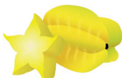
'ĀPARA TĀPAU starfruit