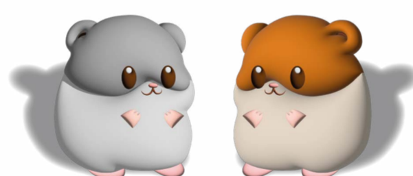
PĪHA'I IHO next to