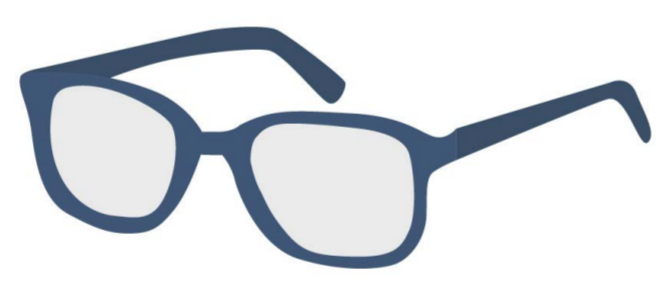
TĪTE'A MATA glasses