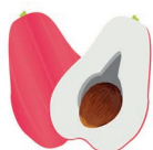
'AHI'A water apple