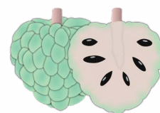
TAPOTAPO sweet sop / cinnamon apple