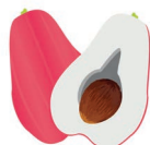
'AHI'A water apple