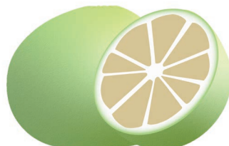
'ĀNANI PAPA'Ā grapefruit