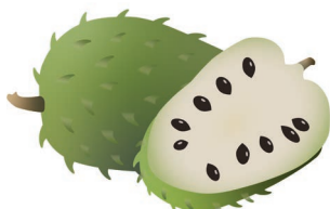
TAPOTAPO TARATARA soursop